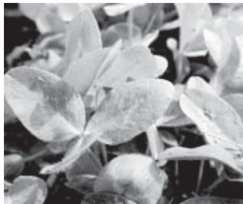
Red clover is not a known host of bean pod mottle virus or bean leaf beetle.