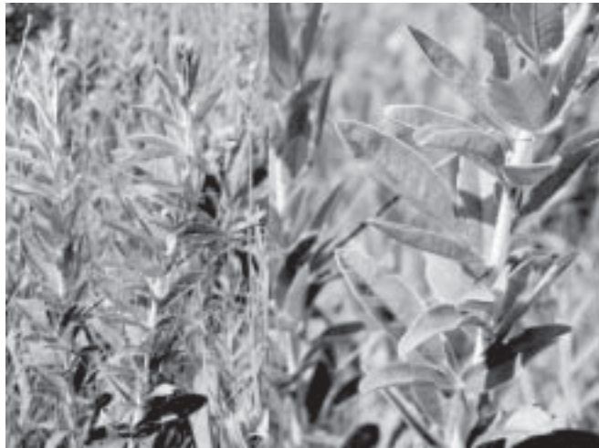
Showy tick trefoil is a known host of bean pod mottle virus and bean leaf beetle.

In the scientific literature, at least 13 host plants are reported for both BPMV and bean leaf beetles (Table 1). None of these hosts are alfalfa, red clover, and birdsfoot trefoil ( Integrated Crop Management , June 23, 2003, page 97). Recently, Rayda Krell (an entomology graduate from Iowa State University) tested numerous plants in high BPMV areas, and using three different laboratory assays, she found only one to be positive for BPMV in Iowa, Desmodium canadense , or showy tick trefoil. Most of the plants in her study were only single samples; however, some, such as alfalfa, were tested more extensively and were found to test negative for BPMV. These research results indicate that many legumes may not be important in the disease cycle of BPMV. Furthermore, although Desmodium species are common in some regions in Iowa, the importance of these plants in the ecology