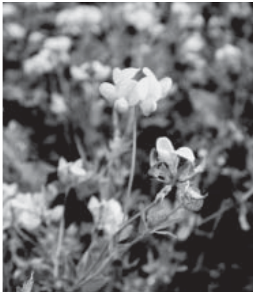
Birdsfoot trefoil (yellow flowers) is not a known host of bean pod mottle virus or bean leaf beetle.

of BPMV is not known. Therefore, no management of wild hosts is recommended. We are continuing our research on the host range of BPMV and will keep you informed of our progress.