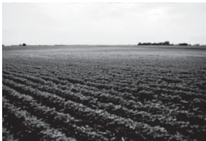
Soybean field with iron deficiency.

Soybean diseases generally can be grouped as warm-season diseases and cool-season diseases because different pathogenic fungi have different temperature ranges for infecting plants. Typically, viral diseases, such as bean pod mottle virus, and some fungal diseases (Phytophthora rot, stem